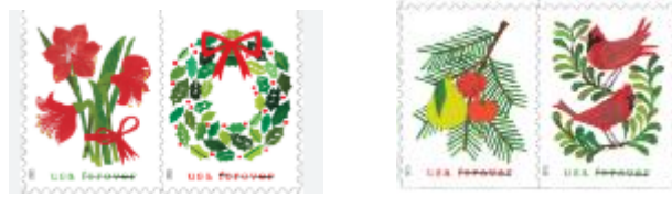
(2025 Winter Cheer Stamps!)

We will have our traditional Christmas Party in December as well! Hope to see everyone there then!